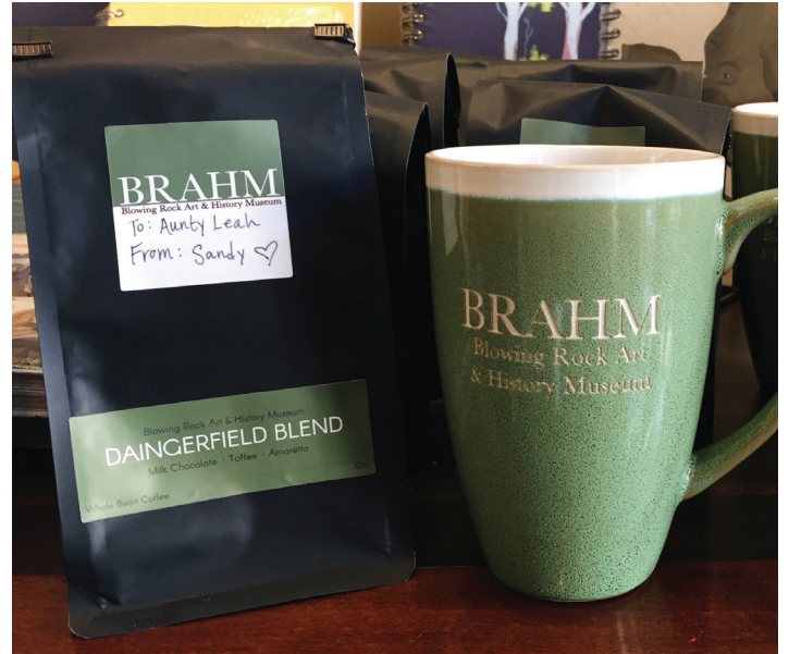
Clockwise from top left: Interior of BRAHM Gift Shop; Interior of BRAHM Gift Shop (alternate view); BRAHM's Daingerfield Blend from Hatchet Coffee Co.