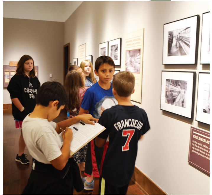
School children on a field trip tour of the exhibit The Photography of Lewis Hine: Exposing Child Labor in North Carolina, 1908-1918 .