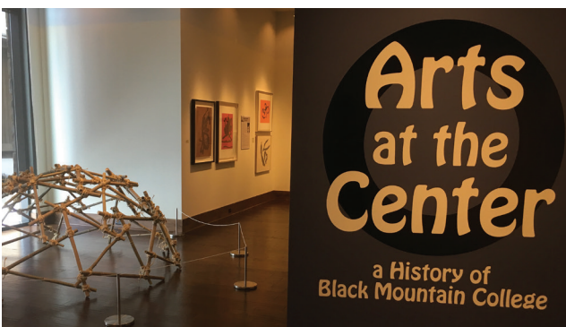
Gallery view of Arts at the Center: A History of Black Mountain College