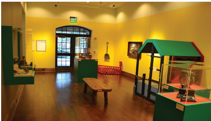
Gallery view of History of the Tweetsie Railroad.