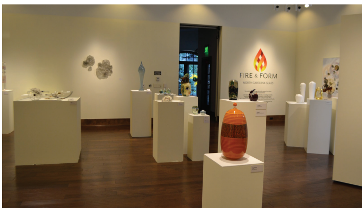
Gallery view of Fire & Form: North Carolina Glass