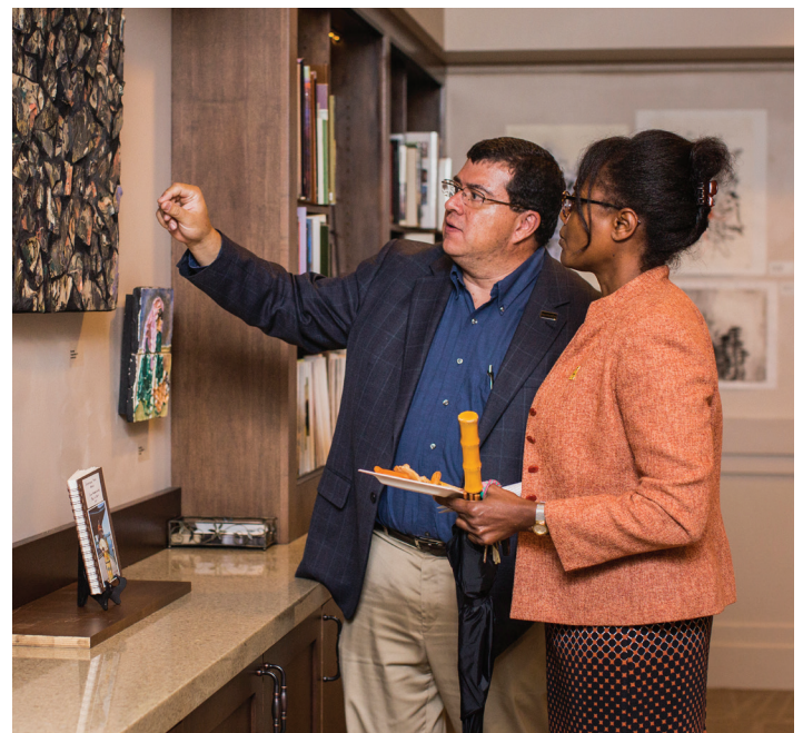
From left to right: Visitors admire artwork at Fire & Form during the 2017 Summer Exhibition Celebration; Visitors discussing artwork at the 2017 Fall Exhibition Celebration.