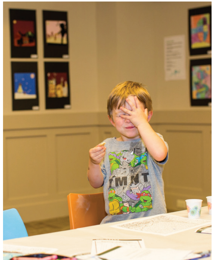
From left to right: Participants of a Face Jug Workshop; Visitor at Young at Art Spectacular, May 2017.