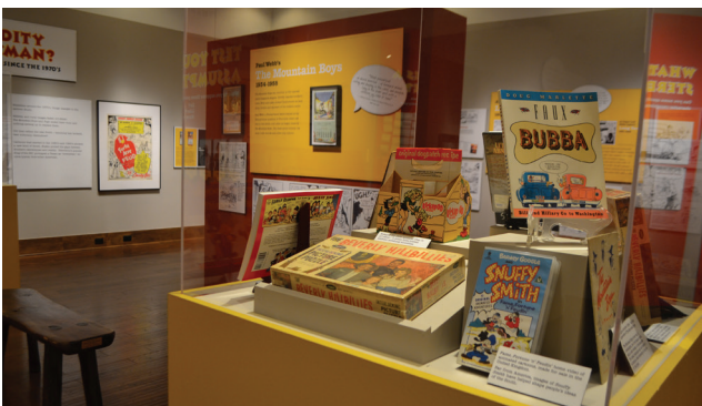
Gallery view of Comic Stripped: A Revealing Look at Southern Stereotypes in Cartoons