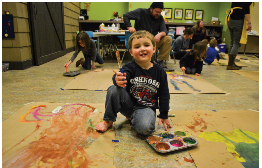
Left: Attendees painting at Cork & Canvas; Top: Afternoon Art Club; Bottom: Doodlebug Club