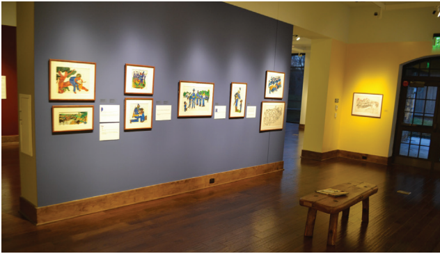
Gallery view of Romare Bearden. Li'l Dan, the Drummer Boy: A Civil War Story.