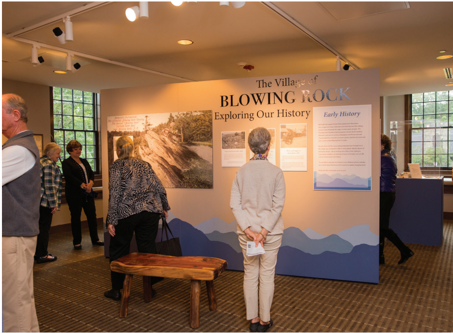
Visitor experiencing our newly added permanent exhibit The Village of Blowing Rock: Exploring our History .