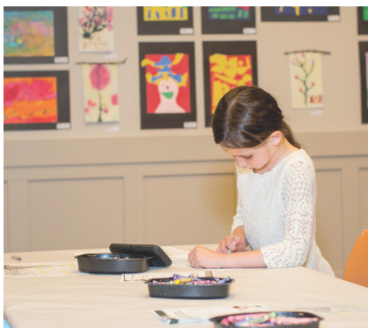
Student making art during the Young at Art Spectacular at our 2017 Summer Exhibition Celebration.

Here at the Front Desk, it was a pleasure to greet those who gathered here for our exceptional 2017 exhibits and programming, to thank them for supporting our institution by purchasing from our brand new gift shop, and to communicate the ever-growing list of reasons to consider a BRAHM Membership. Creating an atmosphere of warmth and inclusivity right at the front door is one of the first steps of advocating the message that art and history are for everyone, and in 2017, this was a responsibility that Visitor Services was proud to fully embrace. There are a variety of reasons why people step foot in this beautiful building, and they frequently don't even involve art or history: Sometimes folks just stumble upon us in their search for directions, a restroom, or a nice postcard. In these moments, Visitor Services welcomes wayfarers with a wonderfully unexpected opportunity to become acquainted with our unique town! What an honor it was to engage with visitors from both near and far, and to personally welcome them to explore our regional art and history!