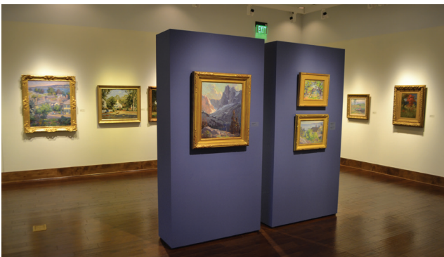
Gallery view of Impressions of the Land.